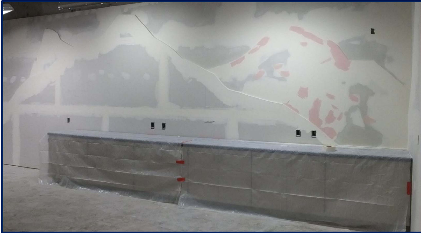
Brooktree – FIS