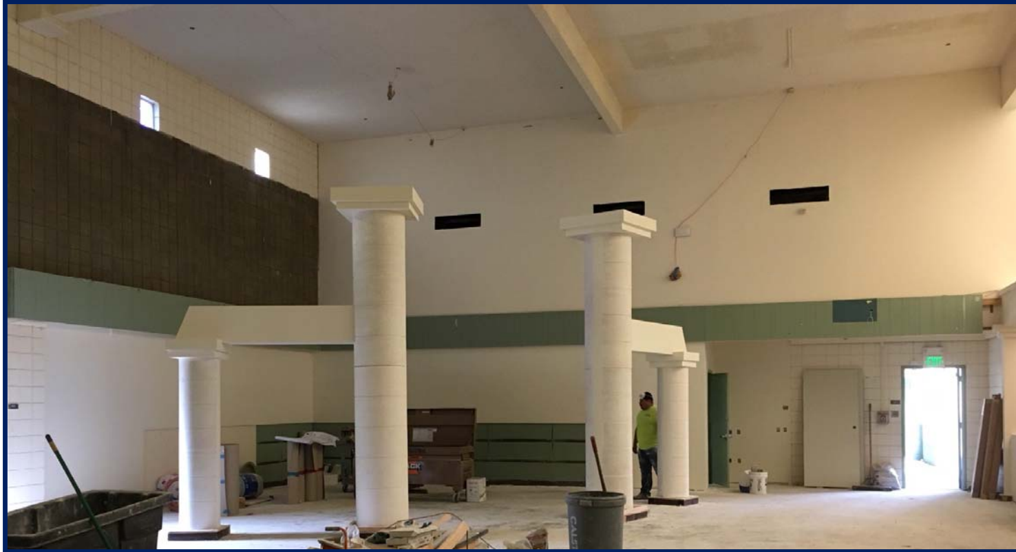
Morrill - FIS