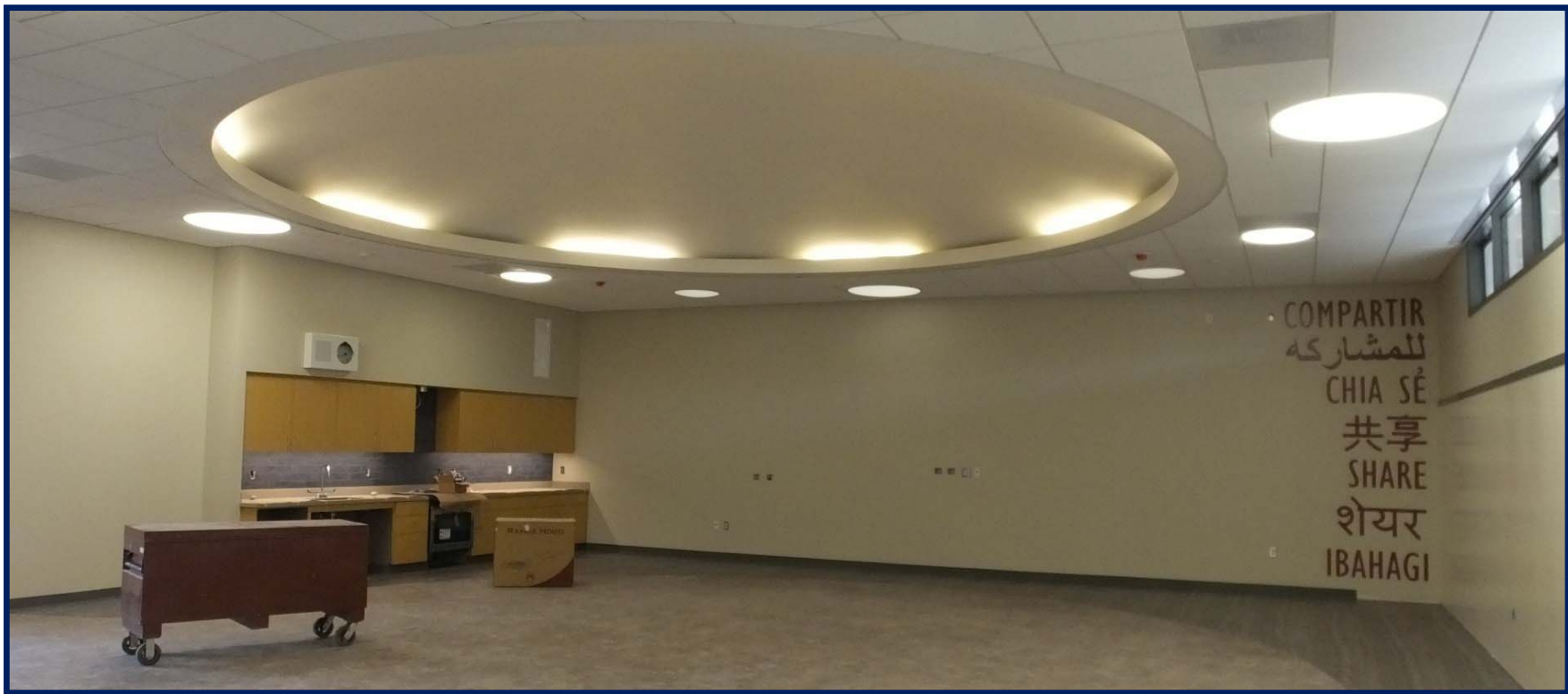
Piedmont - FIS