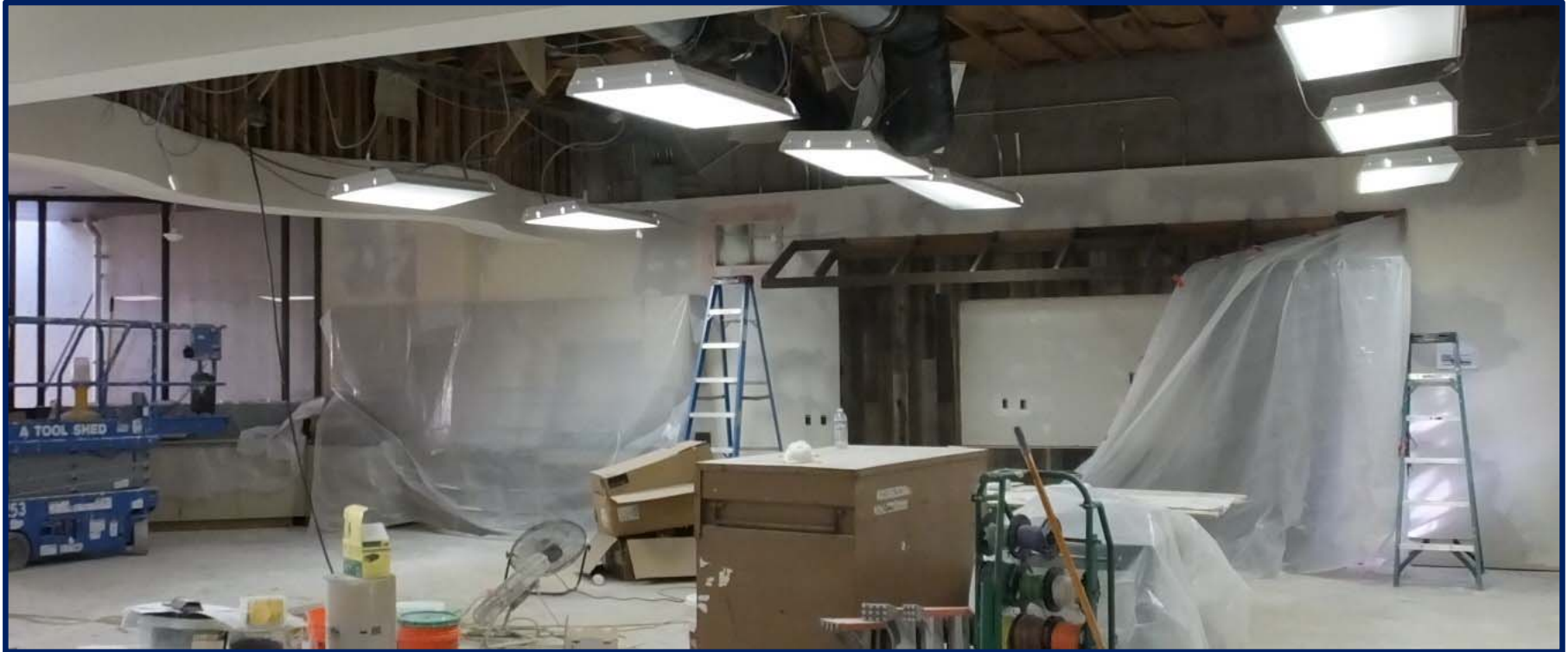
Brooktree – FIS