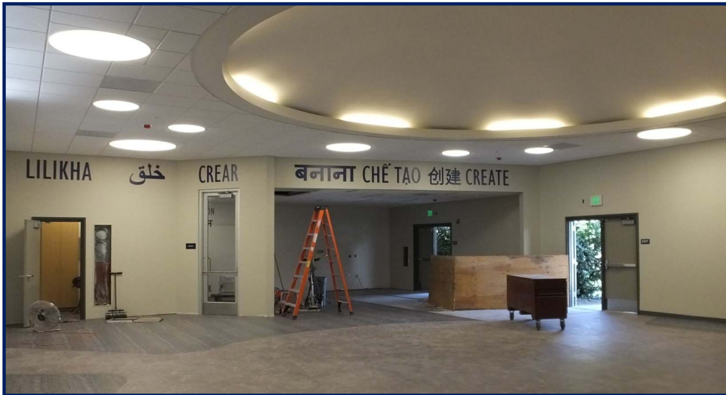
Piedmont - FIS