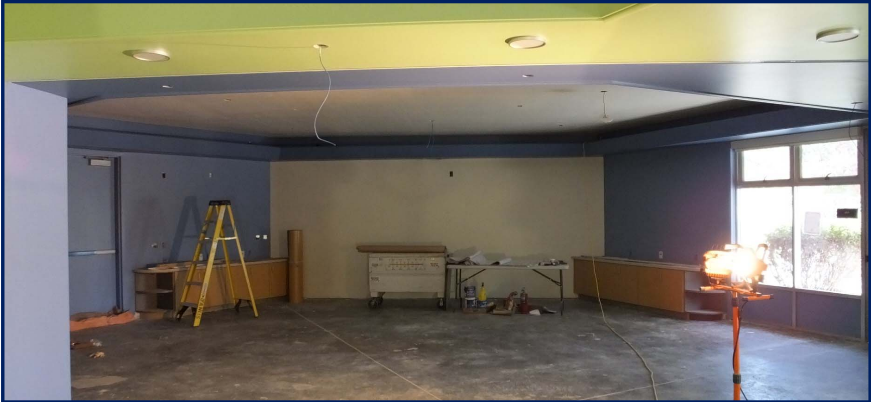
Ruskin - FIS