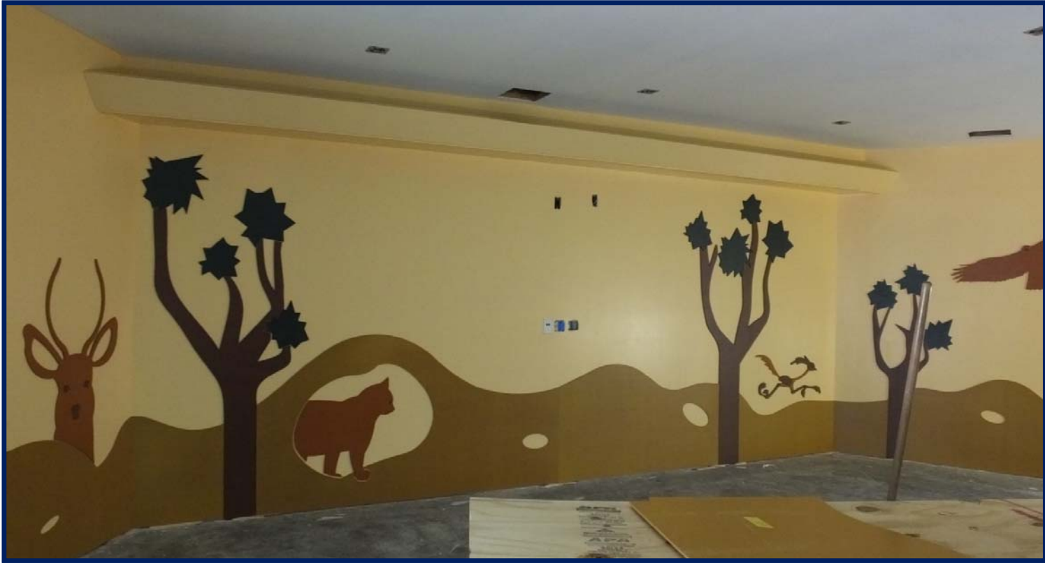
Ruskin - FIS