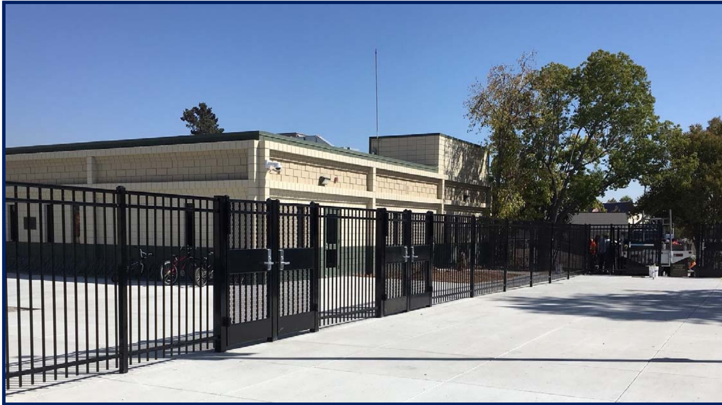
Morrill – Exterior Fencing