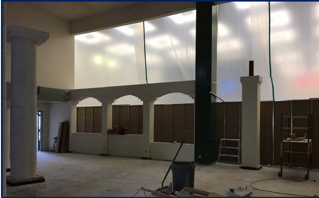
Morrill - FIS